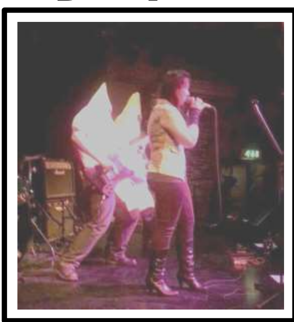
Pre-loved Rawk'n'Roll ...and a certain degree of stupidity