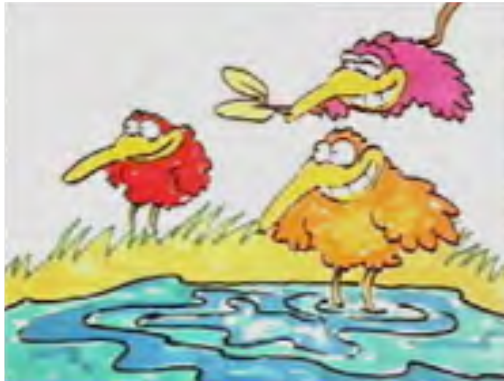
...and the birds just laughed....